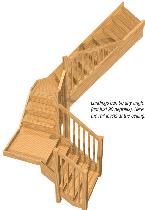
Landings can be any angle (not just 90 degrees). Here the rail levels at the ceiling.